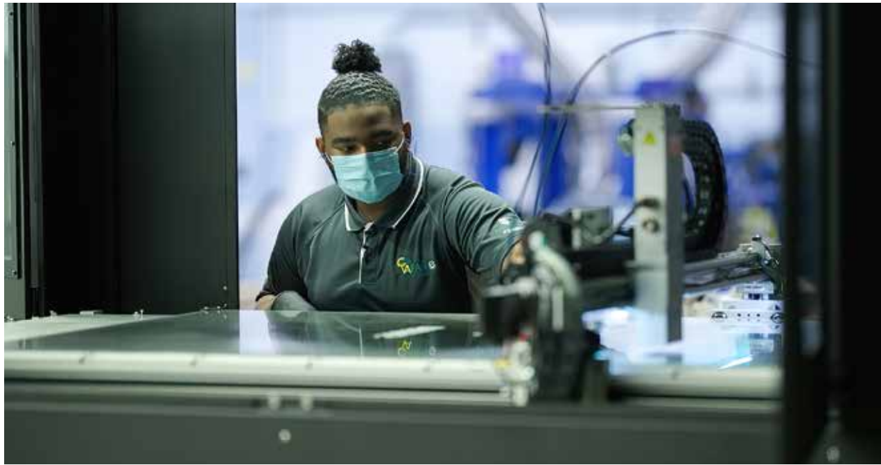
FAME student learns to operate 3D printers at Armsted Rail.