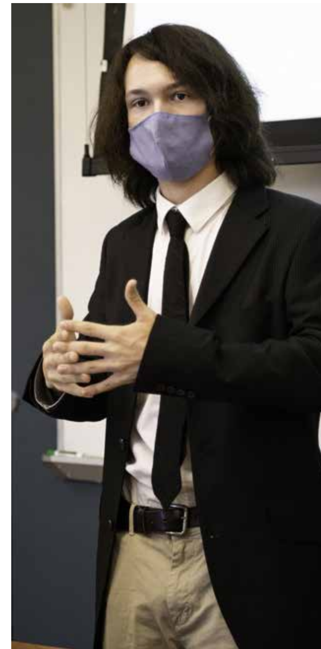
Student Assembly officers are always looking for how they can represent the study body.

The organization works hard to turn students' ideas into realities. It functions as the bridge between students, faculty, and staff. Wallace explains, "The purpose of Student Assembly is to represent the voice of students. I hope the organization can grow and provide students what they want."