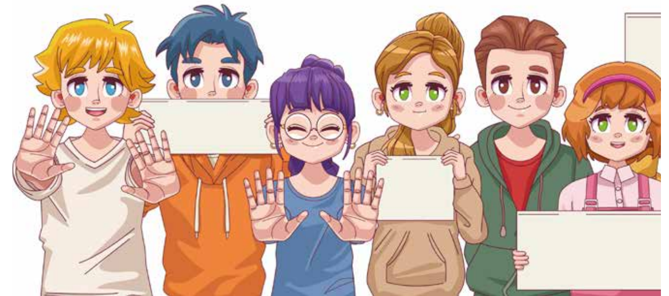
RBC Anime Club members come together to enjoy comradery and share their interest in anime works that are inspired by Japanese animation.