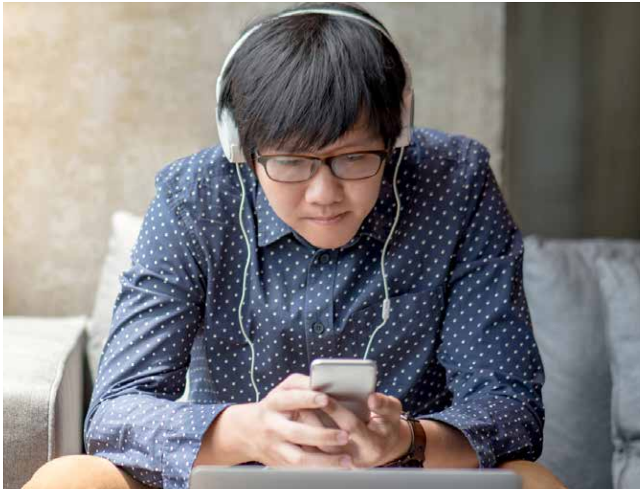
Watching anime has helped students learn more about current social problems.